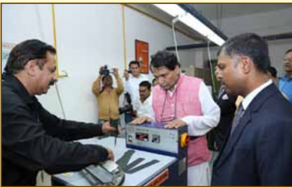
Hon'ble C&IM, Mr. Suresh Prabhu observing the Footwear Manufacturing Technology & Process

The Hon'ble C&IM visited the Pilot Plant which includes Cutting, Closing, Component, Lasting and Finishing Workshop, classroom etc., and was happy to see the world-class infrastructure present in the Institute.