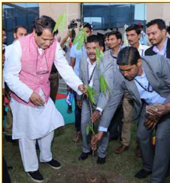
Hon'ble C&IM, Mr. Suresh Prabhu, planting a sapling

The Hon'ble C&IM praised the infrastructure, quality & décor of the campus which is a visual landmark in the area.