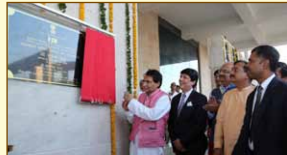
Unveiling of the Plaque by Hon'ble C&IM, Mr. Suresh Prabhu