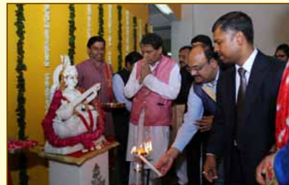
Unveiling of the Plaque by Hon'ble C&IM, Mr. Suresh Prabhu

The Hon'ble C&IM inaugurated the FDDI Ankleshwar campus by unveiling the Plaque at 06.30 PM.