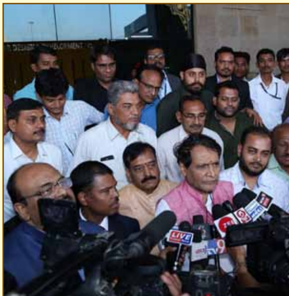
Hon'ble C&IM, Mr. Suresh Prabhu addressing the media

The Institute is having latest machinery, electronic and CAD/CAM based design support.