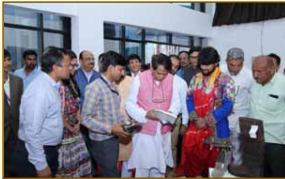
Hon'ble C&IM, Mr. Suresh Prabhu observing the footwear designed by the students

Smart class rooms along with adequate number of exclusive workshops in each area of Manufacturing Technology have been created to encourage interactive and practical oriented training in the FDDI Ankleshwar campus.