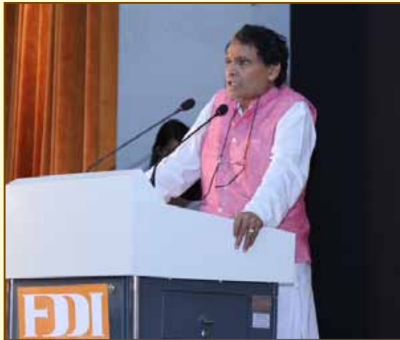
Mr. Suresh Prabhu Hon'ble C&IM delivering the 'Keynote Address'

"Footwear is one sector which keeps growing constantly and is one of the thrust area of the Government for which this beautiful campus has been established" added Mr. Prabhu.