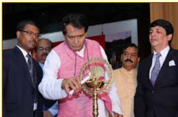
Lighting of the 'Inaugural Lamp' by Hon'ble C&IM, Mr. Suresh Prabhu

The Hon'ble C&IM praised the infrastructure, quality & décor of the campus which is a visual landmark in the area.