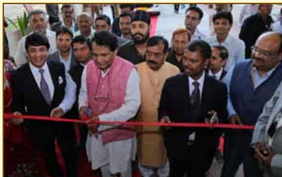
Hon'ble C&IM, Mr. Suresh Prabhu cutting the ribbon and inaugurating the FDDI Ankleshwar Campus

The campus is located at Plot No. H-3301, Near ESIC Hospital, GIDC Ankleshwar Industrial Estate, Gujarat.