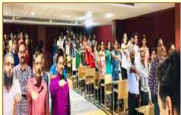
Staff of FDDI Hyderabad campus taking the 'Integrity Pledge'

In order to generate maximum public participation as per the theme this year, National Fertilizers Limited (NFL) vide its letter no NFCO/Vig/5/CO/6/2018/553 dt. 16.10.2018 has also requested FDDI to organize Slogan writing, Poster making and Quiz competitions.