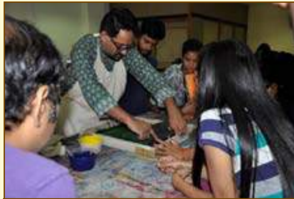
The workshop in progress