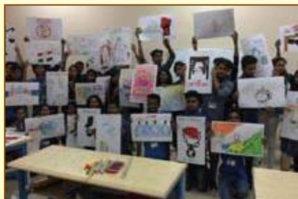
A view of Poster making competition held at FDDI Patna campus

discharging their duties and desist from indulging in corrupt practices and lead an honest and non-corrupt life.