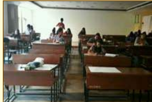
'A view of Poster making competition held at FDDI Fursatganj campus