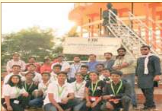
'Nukkad Natak' held during 'Vigilance Awareness Week -2018' at FDDI Guna campus

During the 'Vigilance Awareness Week', Slogan writing, Quiz, Essay writing, Debate, 'Nukkad Natak' and Poster making competition reflecting the aforementioned theme were also held in the respective campuses of FDDI.