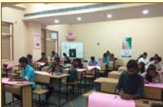
A view of Poster making competition held at FDDI Chhindwara campus

Measures towards preventive vigilance at various level of functioning enhance efficiency, transparency and accountability and helps in reducing corruption.