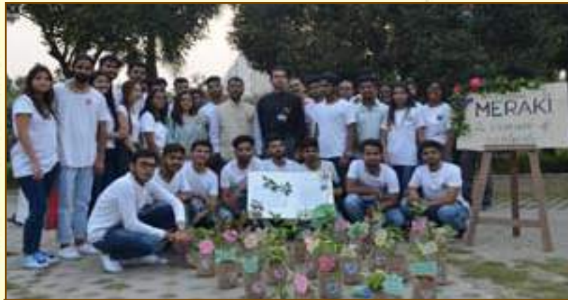
The students of B.Sc. FDP 2016-19 Design Specialization

The students took inspiration and followed the ethos of design from environment, architecture, heritage, natural world and contemporary ideas to develop the ideations, material swatch developments/explorations such as weaving, quilting, pleating, cutwork, patchwork, applique, interlacing, hand embroidery, hand padding, leather etching & embossing etc., in various materials like paper, yarn, fabric, leather, non-leather.