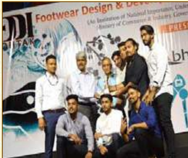
Students receiving the prize

'Abhivyakti 2019' was sponsored by Today Footwear, BNG Fashion Gear, XO Footwear, Manjeet Plastic Industries, Nexgen Marketing, Rajan Packaging Material, ICICI Bank, Shiva Industries, Creative Design (India), My Dreamz World, Amul and Coca Cola.