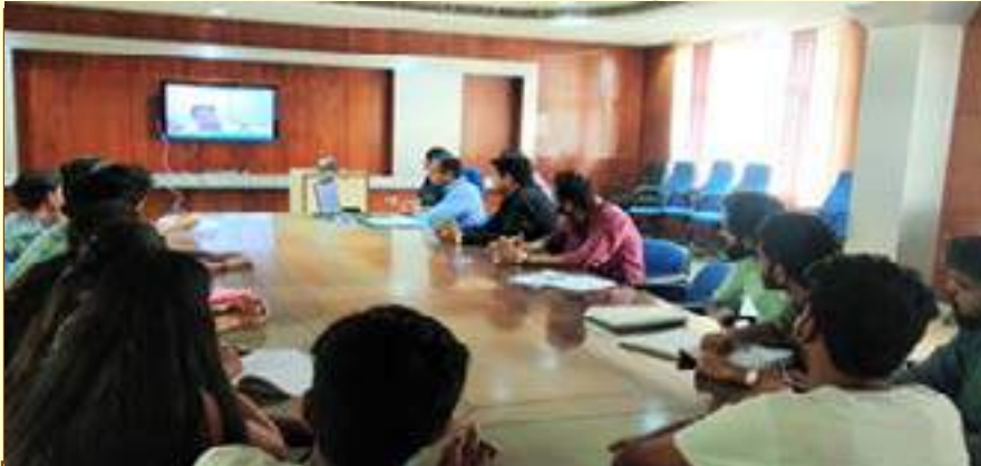
Online panel discussion in progress

Such platform gives students to understand the challenges and opportunities of the sector/industry in a better manner.