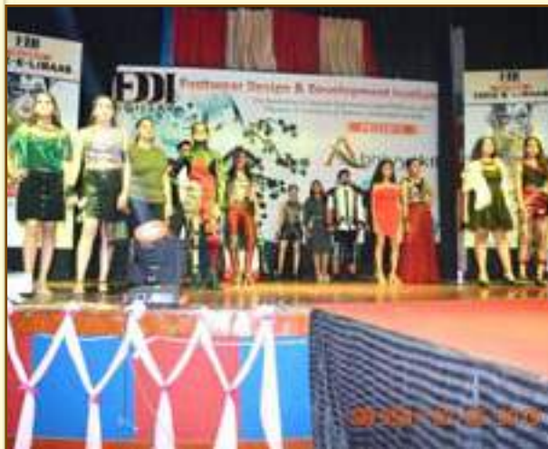
A view of the fashion show 'Tarz-E-Libaas'