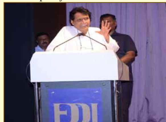
Mr. Suresh Prabhu, Hon'ble C&IM delivering the 'Keynote Address'

Apart from academic infrastructure, this magnificent and beautiful campus is also having Badminton, Table Tennis, Football and Cricket playgrounds. The Boys hostel capacity is 228 and Girl's hostel capacity is 144.