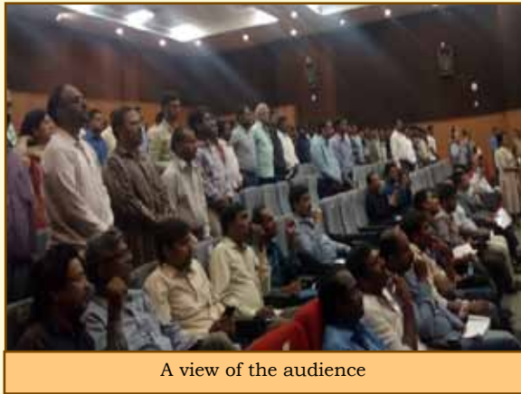
A view of the audience

would implement a holistic strategy to 'rejuvenate and reinvent' the country's leather sector."