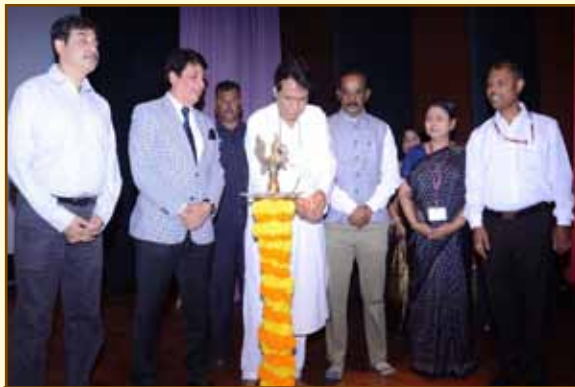
Lighting of the 'Inaugural Lamp' by Hon'ble C&IM, Mr. Suresh Prabhu

To cover the inaugural ceremony of the FDDI Hyderabad campus a large number of media which included representatives from The Hindu – Special correspondent, Eenadu, Sakshi, Andhra Jyothi, Deccan Chronical, Economic Times, V6, Telangana Today, Namastey Telangana, E TV, TV 5, Ruby TV, BBN News, Deccan TV, Andhra Prabha, Siyasat, Hindi Milap, TV 9 and other many channels were present.