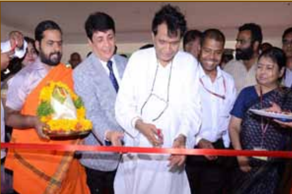
Hon'ble C&IM, Mr. Suresh Prabhu cutting the ribbon and inaugurating the FDDI Hyderabad Campus