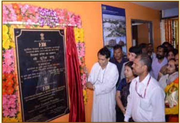
Unveiling of the Plaque by Hon'ble C&IM, Mr. Suresh Prabhu

The newly constructed building of the Hyderabad campus of Footwear Design & Development Institute (FDDI) - an Institution of National Importance (INI), was inaugurated on 5th July 2018 by the Hon'ble Minister of Commerce & Industry, Government of India, Mr. Suresh Prabhu in the august presence of Mr. Boora Narsaiah Goud, Member of Parliament.